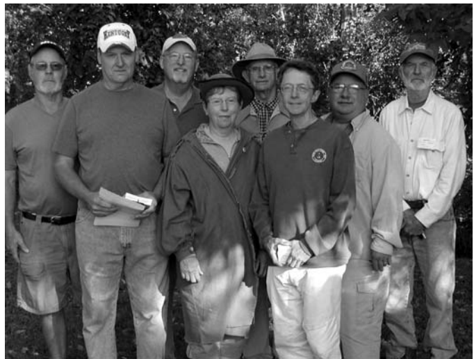
Running Boar shooters