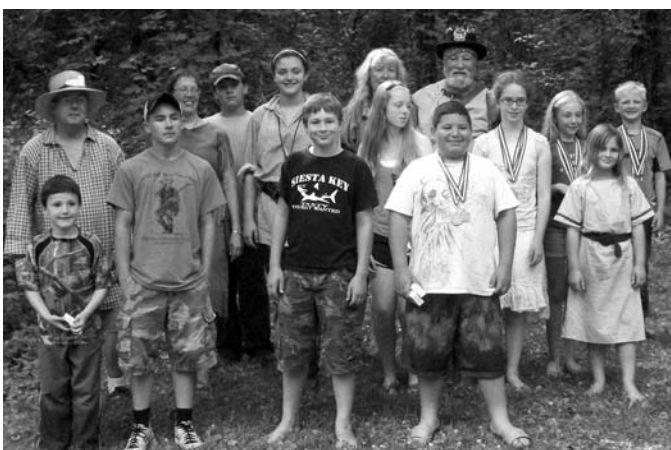
Tomahawk and Knife winners