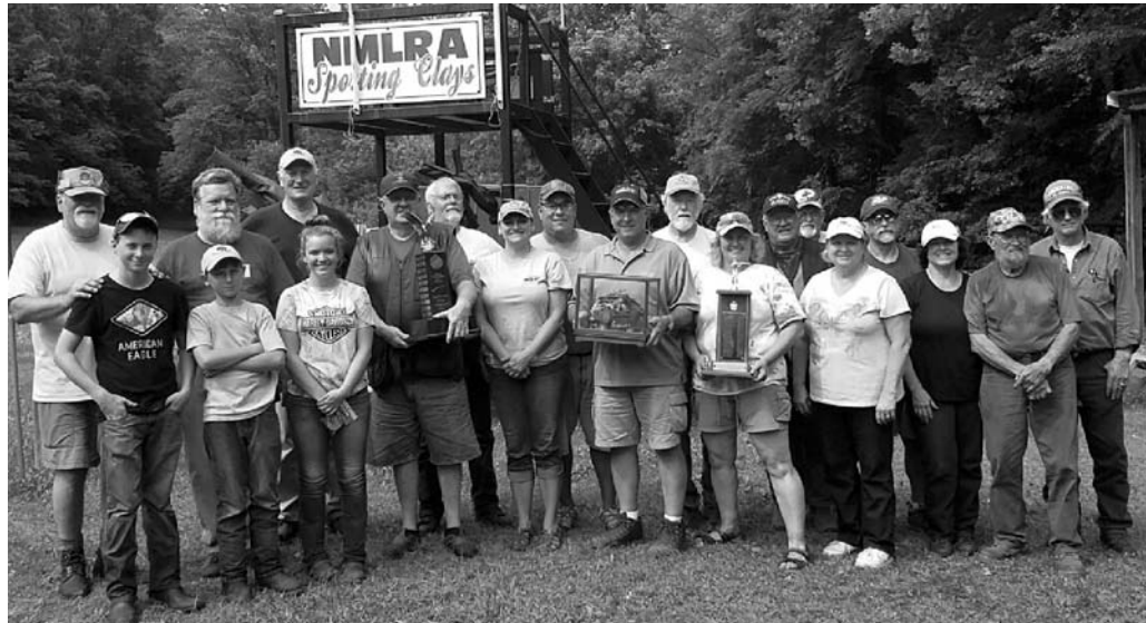
Sporting Clays winners